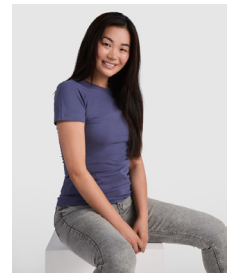
JAMAICA WOMAN R6627