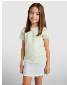
BREDA KIDS K6698