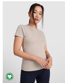
GOLDEN WOMAN R6696