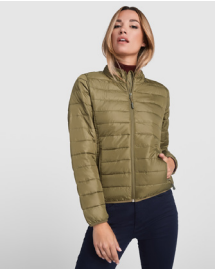
FINLAND WOMAN R5095