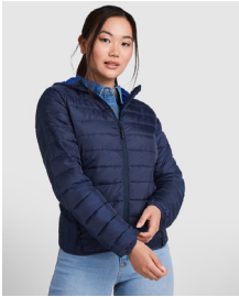
NORWAY WOMAN R5091