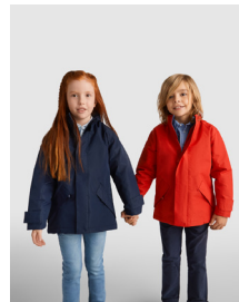
EUROPA KIDS K5077