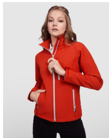
ANTARTIDA WOMAN R6433