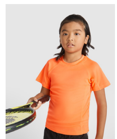
MONTECARLO KIDS K0425