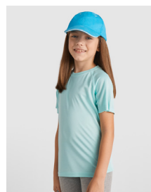
BAHRAIN KIDS K0407