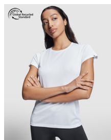
IMOLA WOMAN R0428