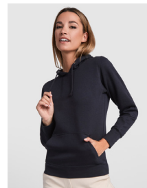
URBAN WOMAN R1068