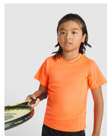
MONTECARLO KIDS K0425