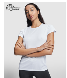
IMOLA WOMAN R0428