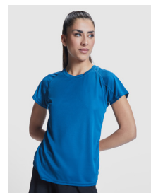
BAHRAIN WOMAN R0408