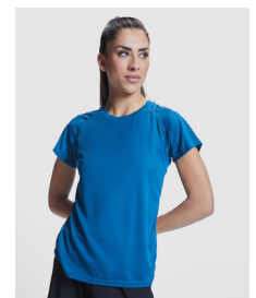
R0423 BAHRAIN WOMAN R0408