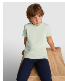
STAFFORD KIDS K6681