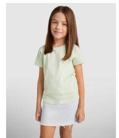
BREDIA KIDS K6698